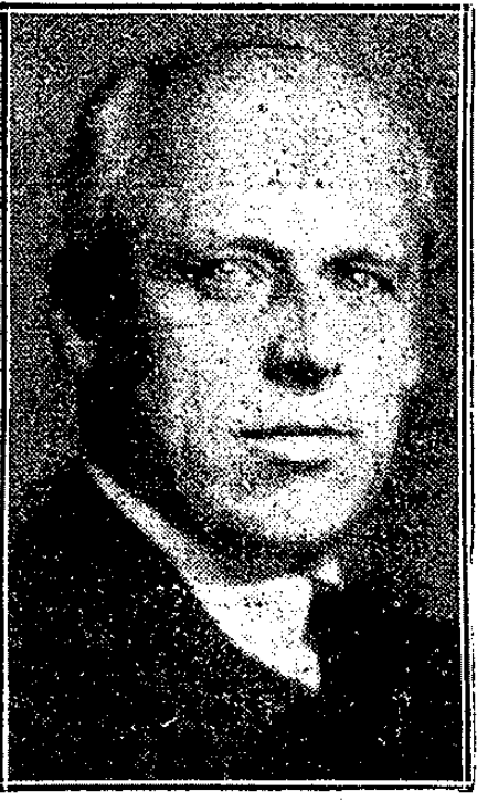
Norman Thomas, Socialist candidate for President, will speak on a national radio hookup October 1.